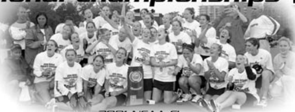
2001 NCAA Champions

The Terps are the winningest team in the history of women's lacrosse with an all-time record of 449-107-3.